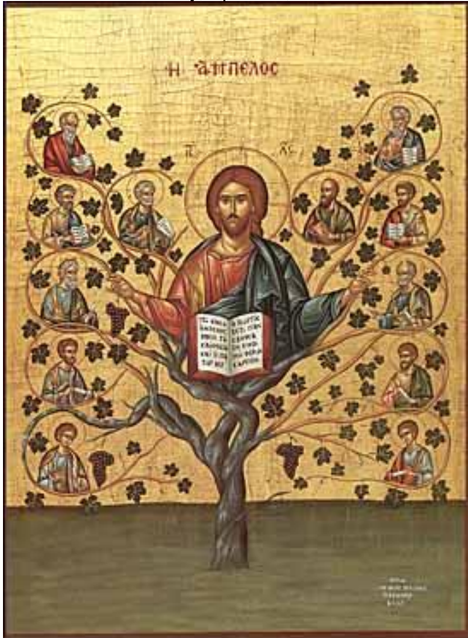
Icon of Christ the True Vine (late 20th century), Dormition Convent, Parnes, Greece, based on an early 15th century by Angelos Akotantos at Malles, Hierapetra