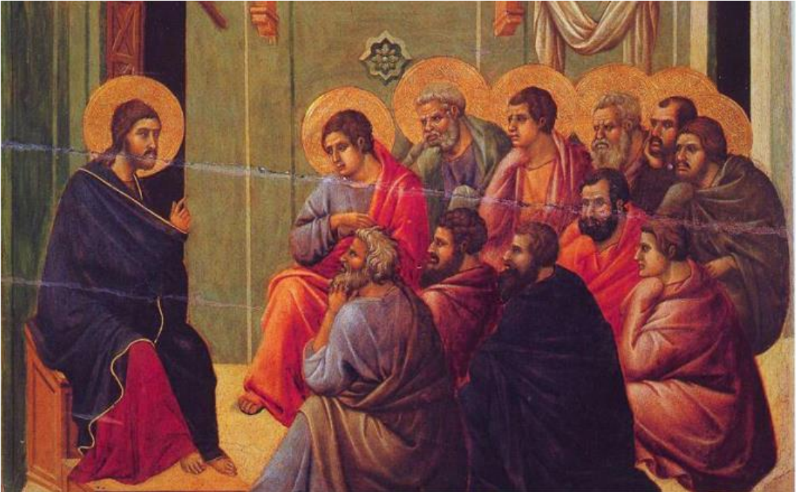
Christ Taking Leave of the Apostles by Duccio di Buoninsegna