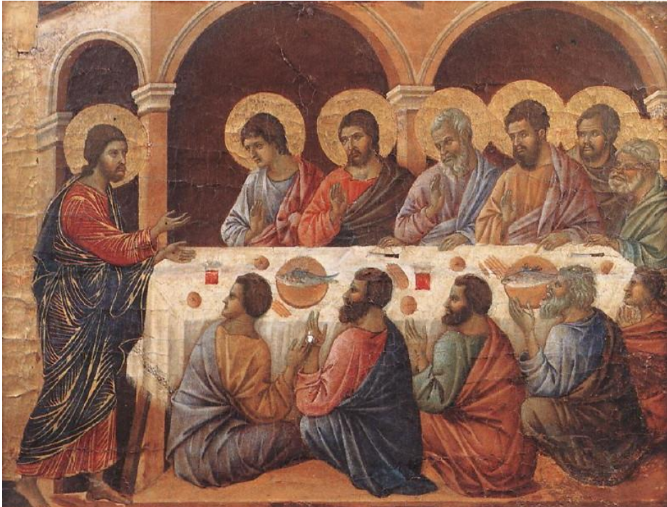
Jesus' Appearance While the Apostles are at Table by Duccio di Buoninsegna (1255-1319)