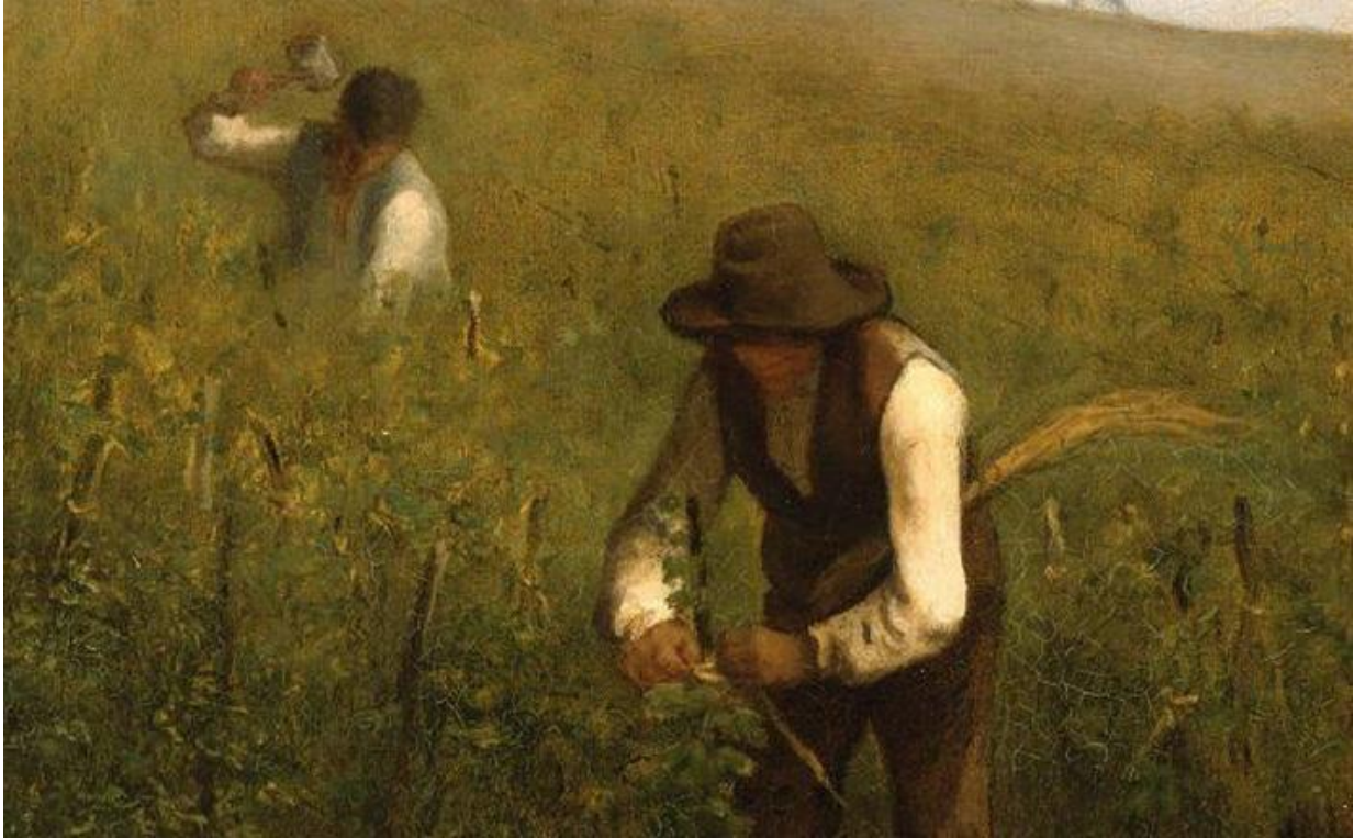
Millet, Jean François, "In the Vineyard" from Art in the Christian Tradition, a project of the Vanderbilt Divinity Library, Nashville, Tenn