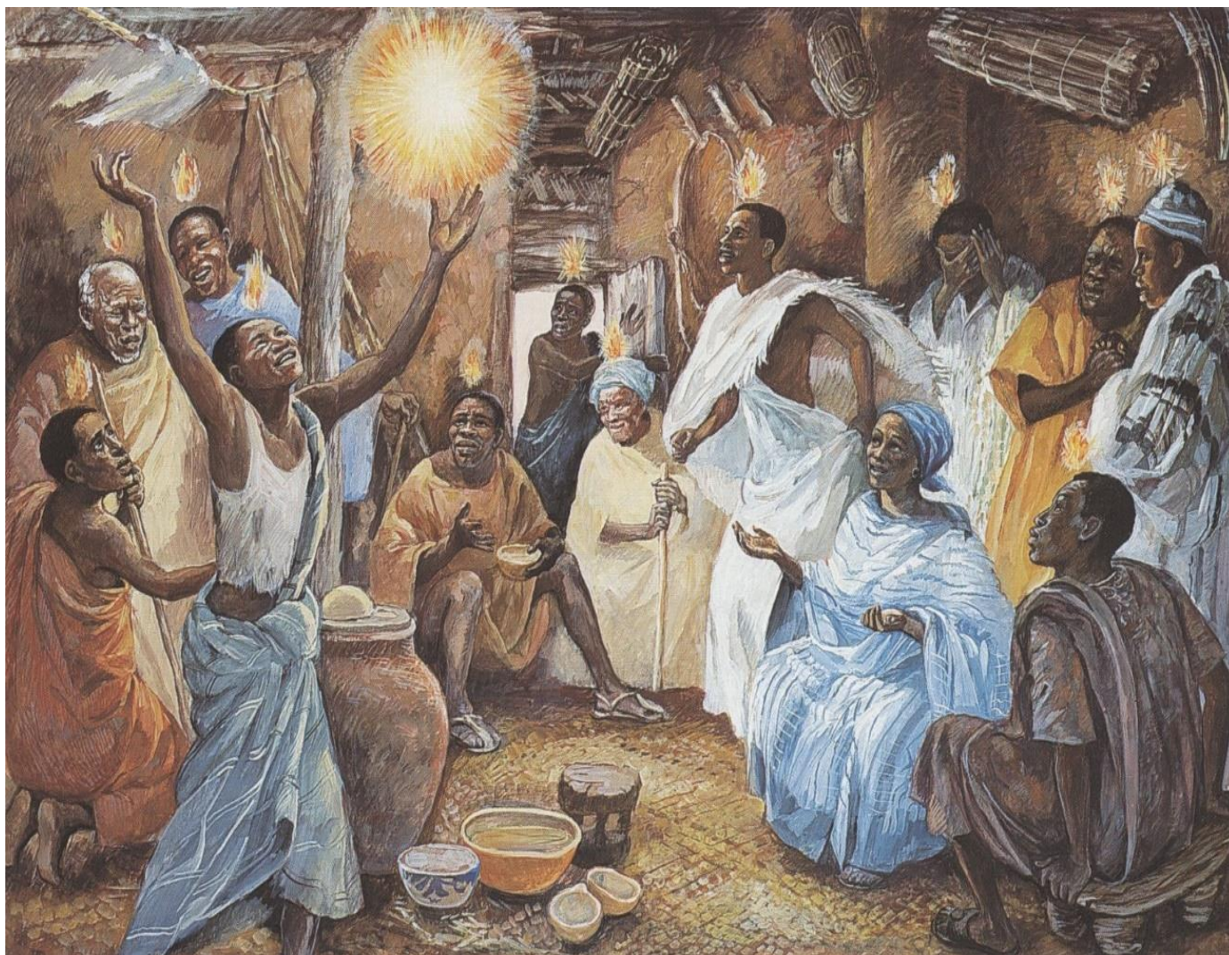
JESUS MAFA. Pentecost ,

from Art in the Christian Tradition, a project of the Vanderbilt Divinity Library, Nashville, TN.